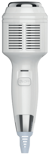
Cold & Warm Hammer