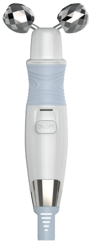
Two-pole microcurrent handle