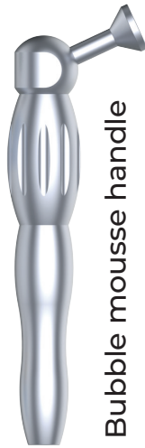
Bubble mousse handle