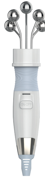
Multipole microcurrent handle