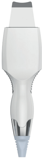
Ultrasound scrubbing handle