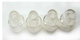
Dermabrasion heads (10 pcs) for hydrodermabrasion handle